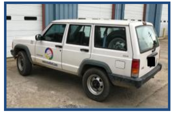
1999 Jeep Cherokee