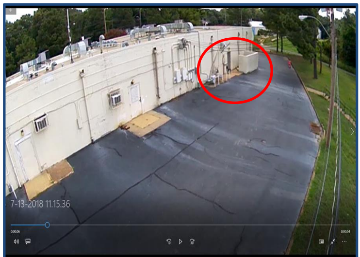
The view of a surveillance camera at the Hillview Village Apartments site. The site personnel served SFSP meals and snacks from the back of the leasing office.

GYAC sponsored a SFSP site at the Hillview Village Apartments located off Alcy Road in Memphis. GYAC personnel claimed to have served 1,873 lunch meals and 1,826 snacks over a period of 19 days in July 2018 at this site. MPD set up a camera at this site [refer to Exhibit 5 ], and investigators obtained video footage for the 19 days of food service from July 2018. GYAC completed the daily meal count forms for each day they claimed to have served lunch meals and snacks to support the reimbursement requests GYAC submitted to DHS. Investigators obtained the daily meal count forms and compared the numbers listed with the available video-surveillance footage obtained from MPD. Based upon this comparison, investigators determined that GYAC falsified 1,408 lunch meals and 1,361 snacks at this site, representing $6,788.61 in federal reimbursements.