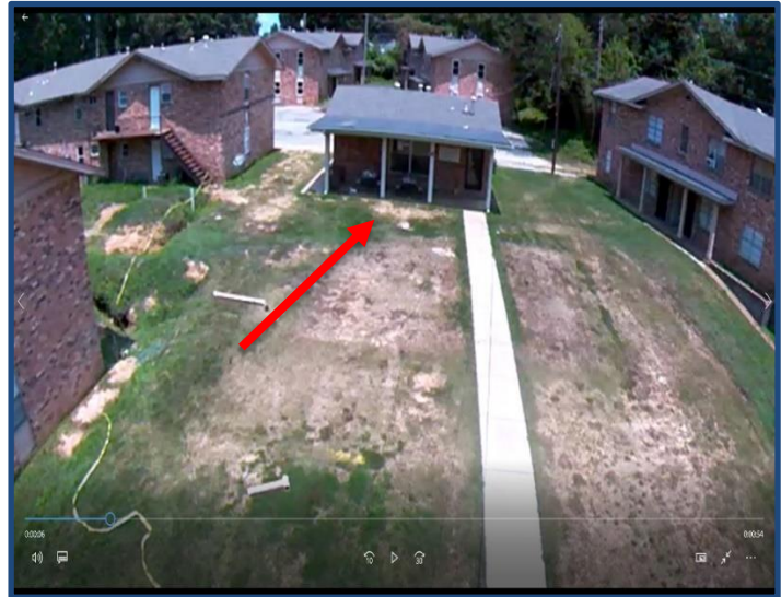
The view of a surveillance camera at the Whitney Manor Apartments site. The site personnel served SFSP meals and snacks outside the community office.

The following table summarizes the falsely claimed federal reimbursements noted above.