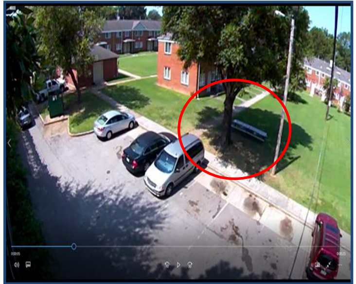
The view of a surveillance camera at the Saints Court Apartments site. The site personnel served SFSP meals and snacks at a picnic table under a tree.

GYAC sponsored a SFSP site at the Saints Court Apartments located off North Watkins Street in Memphis. GYAC personnel claimed to have served 1,014 lunch meals and 1,014 snacks over a period of 19 days in July 2018 at this site. MPD set up a camera at this site [refer to Exhibit 4 ], and investigators obtained video footage for the 19 days of meal service in July 2018. GYAC completed the daily meal count forms for each day they claimed to have served lunch meals and snacks to support the reimbursement requests GYAC submitted to DHS. Investigators obtained the daily meal count forms and compared the numbers listed with the available video-surveillance footage obtained from MPD. Based upon this comparison, investigators determined that GYAC falsified 876 lunch meals and 939 snacks at this site, representing $4,309.38 in federal reimbursements.