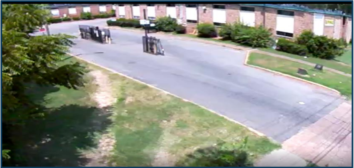
Kimball Cabana camera 1