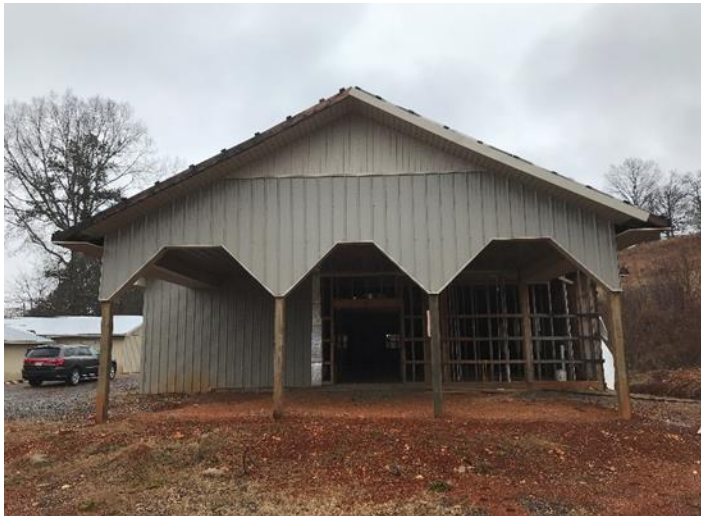
Peakland Baptist Church Rebuild

Peakland Baptist Church (church), located in Meigs County, Tennessee, is home to approximately four members who meet every Sunday and Wednesday for services. The church facility included a sanctuary building for worship and separate fellowship hall. On February 18, 2019, a fire destroyed the sanctuary building. After the fire, church members decided to rebuild the sanctuary building using $189,000 in insurance proceeds, but the reconstruction was not completed due to a lack of funds.