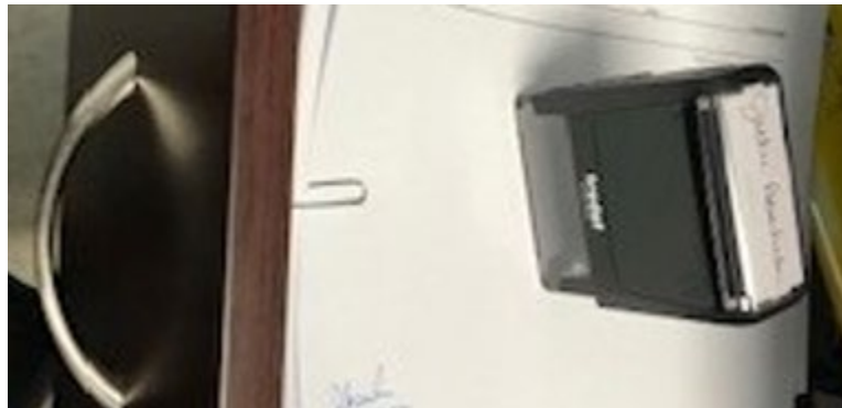
Clerk's signature stamp

The clerk indicated that she has corrected or intends to correct these deficiencies.