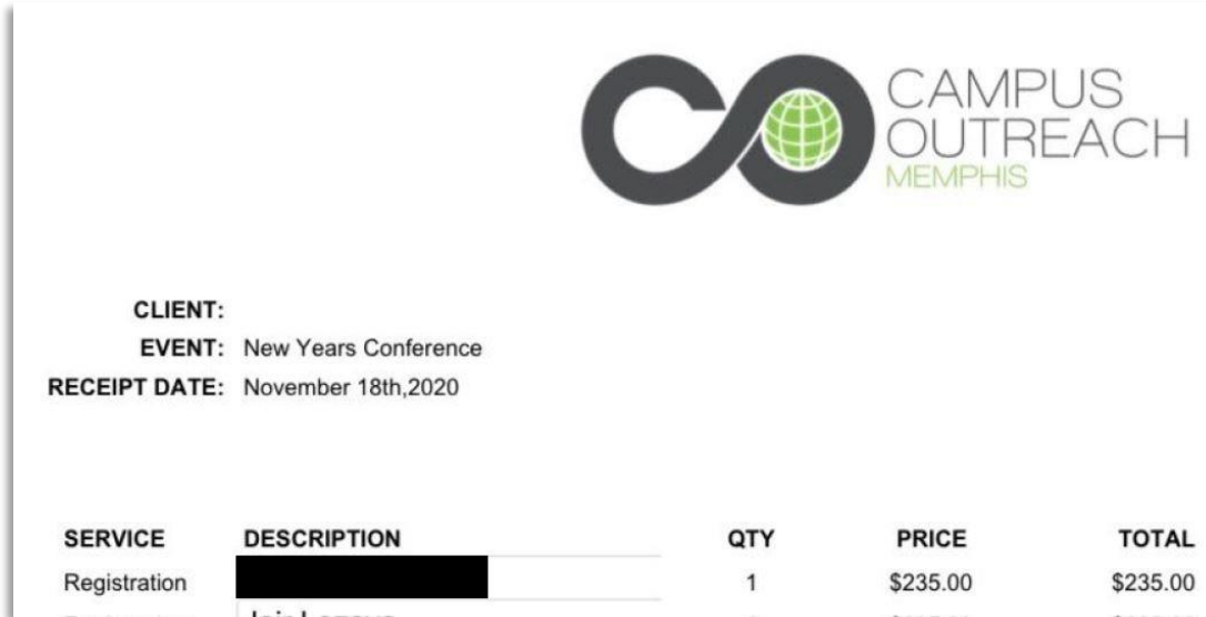
Documentation submitted by Campus Outreach to support the initial request for reimbursement for the 2020 NYC event.

Beginning in December 2020, MTSU personnel repeatedly requested proof of the purchase to support the $4,700 amount. Campus Outreach at MTSU then resubmitted the same document through Smothers reflecting only student names and the $4,700 total. MTSU officials asked for additional support for the amount, to include a copy of a canceled check or credit card receipt or statement. On December 10, 2020, a similar document, which contained misspellings and apparent credit card information and a new date, was submitted to MTSU through Smothers ( Refer to Exhibit 4 ).