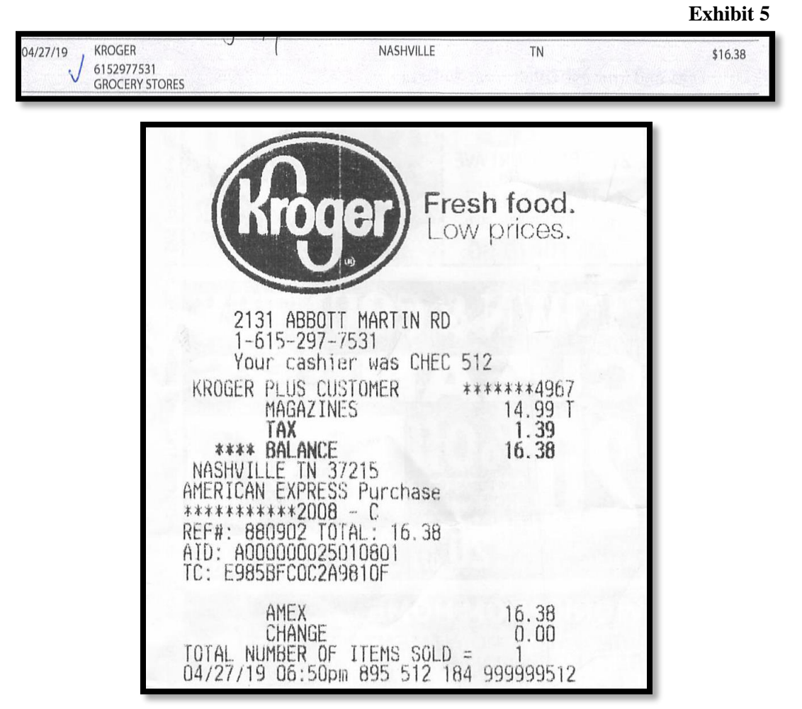
An excerpt of a TACP credit card statement for April 2019. The Executive Director purchased magazines at Kroger that appear to serve no legitimate TACP purpose.

gasoline, and did not have corresponding receipts or any other documentation of prior approval ( Refer to Exhibit 5 ) and ( Refer to Exhibit 6 ). These purchases do not appear to serve any legitimate TACP purpose.