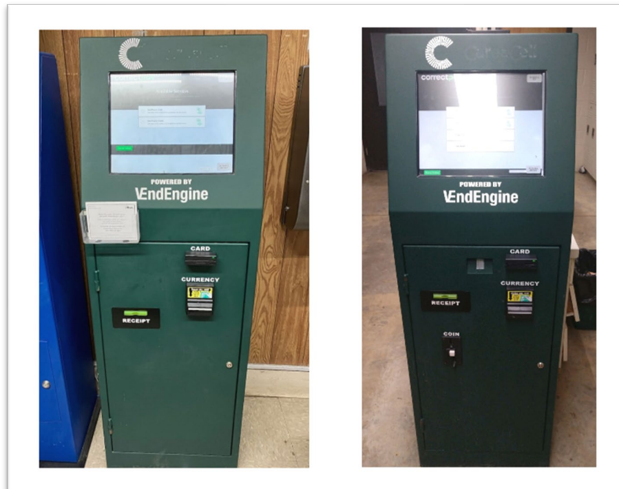
The kiosks that are located in the lobby and booking areas