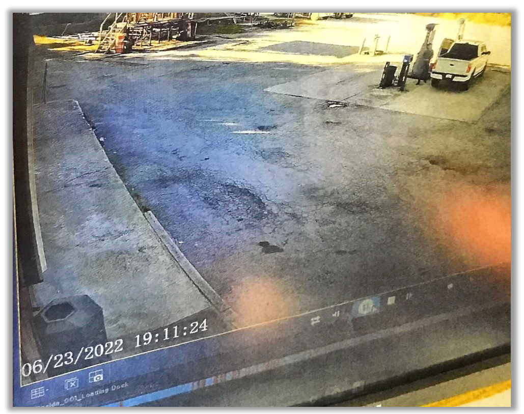
Security camera image on June 23, 2022, of Lay making a personal gasoline purchase using the town's fuel card.