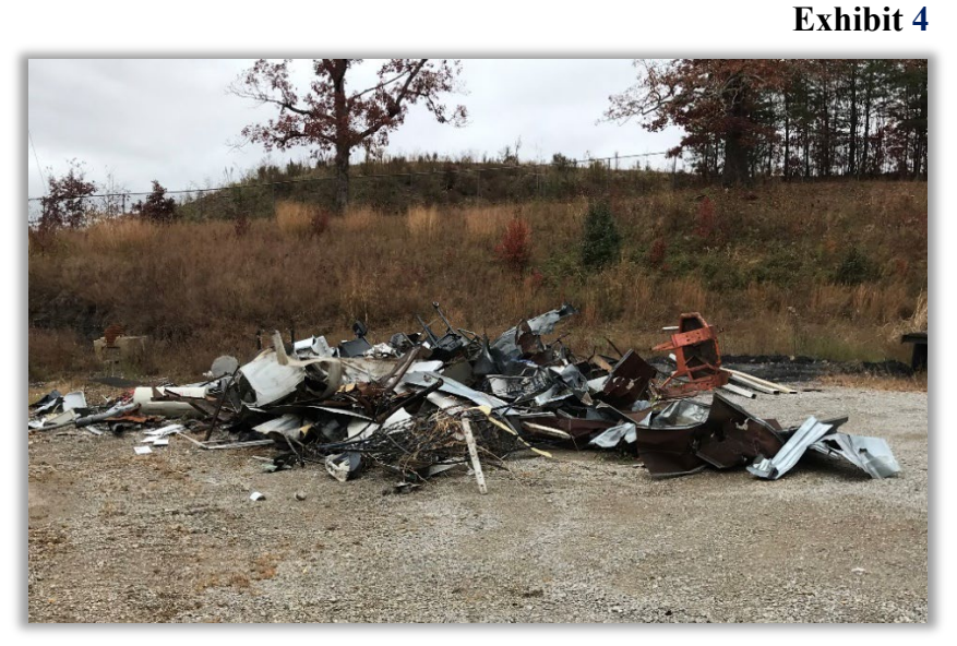
Scrap metal at the street department on October 26, 2022.

bank account within three (3) working days after receipt as required by Section 6-56-111, Tennessee Code Annotated , and the town's board should appropriate the funds to authorize proper use.