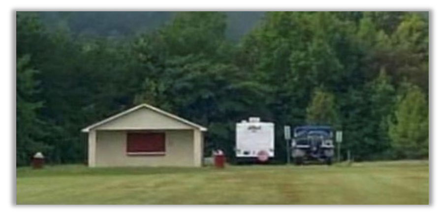
Investigator obtained photograph of the director's camper and pontoon boat parked next to a concession stand at the complex.