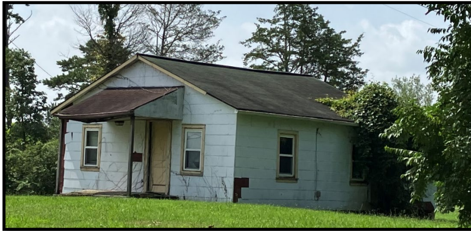
Property documented in the false rental agreement