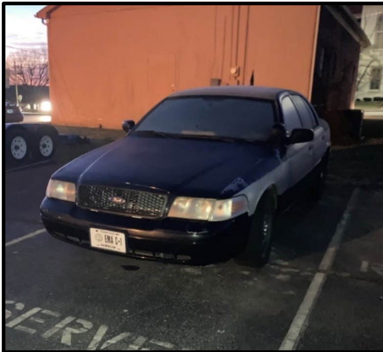
County-owned Ford Crown Victoria car assigned to MHEMA.