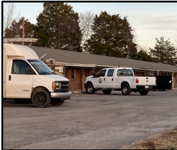
February 8, 2024: MHEMA assigned, county-owned, Ford F-250 truck at the private apartment complex, where it appeared construction work was being performed.