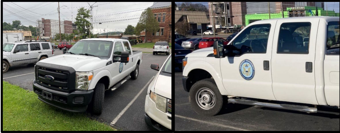
County-owned Ford F-250 truck assigned to MHEMA.