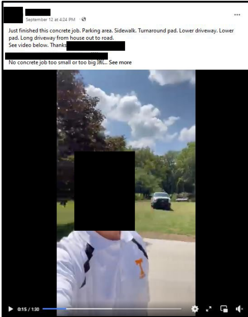
Director's social media post picturing the MHEMA assigned, county-owned, Ford F-250 truck at a personal job site.