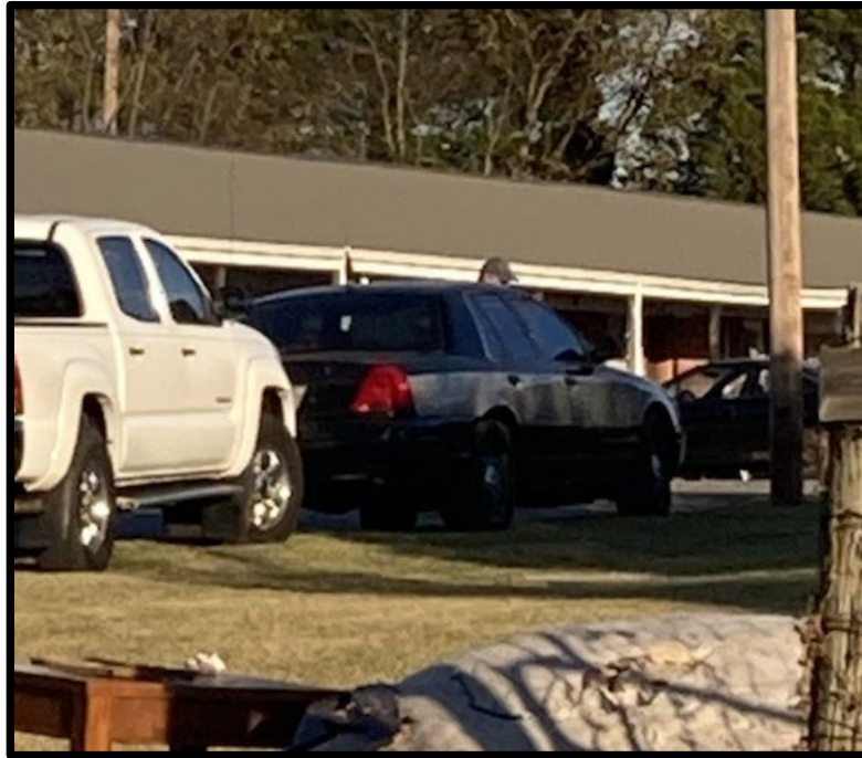
October 26, 2023: MHEMA assigned, county- owned, Ford Crown Victoria car driven by the director at the private apartment complex (he obtained an ownership interest on December 28, 2023).